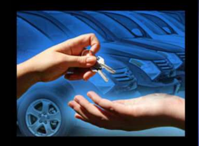
"We had a unique vision of how we could transform the entire auto leasing process"

UBench transforms industry efficiency with automated wireless communication